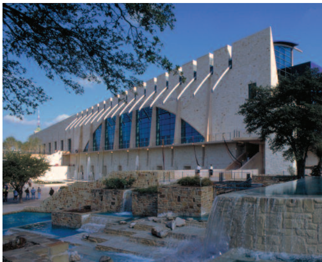
Henry B. Gonzalez Convention Center.

For A.A.s with a bent toward excitement, Texas-sized fun can be had at SeaWorld San Antonio, the world's largest marine life park, and Six Flags Fiesta Texas, the town built just for fun. SeaWorld's "The Steel Eel" is an exciting roller coaster—the only hypercoaster anywhere in