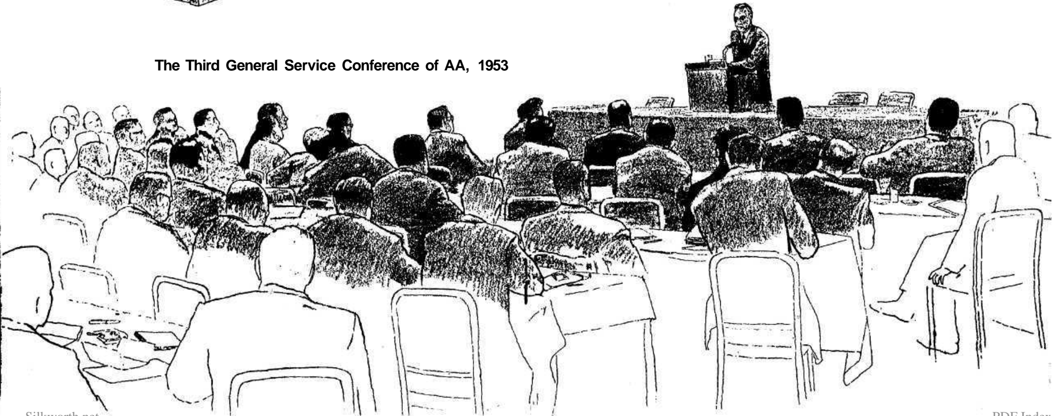
The Third General Service Conference of AA, 1953

filled with wonder as I looked at these pictures, at all that has transpired in the period of time (eighteen years) that is represented by them. I thought of that historic day when Bill made a worried scrutiny of the church directory, followed by anxious phone calls, seeking a drunk to whom to carry the message of hope, fighting