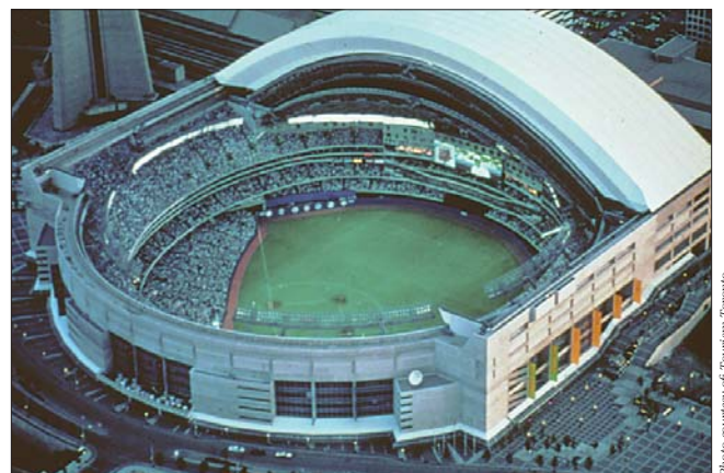
SkyDome Stadium, where the big meetings will be held.

We know that some members may feel discouraged by the need to address the process necessary to travel into Canada—or any future International Convention in North America. We understand, yet we also know that sobriety provides opportunities to become responsible through working the Twelve Steps, and applying A.A. principles in our daily living. One of those principles is that we respect and abide by the law. We are all familiar with the need to adhere to immigration rules and regulations, some of which have been strengthened since